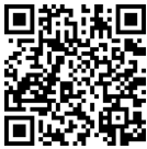
X600 Pro-PCI 3D demo