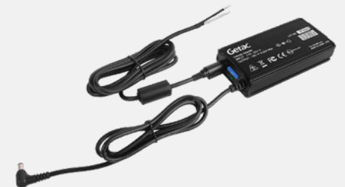
Bare Wire Version